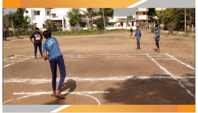
Sports Events organised at Premises