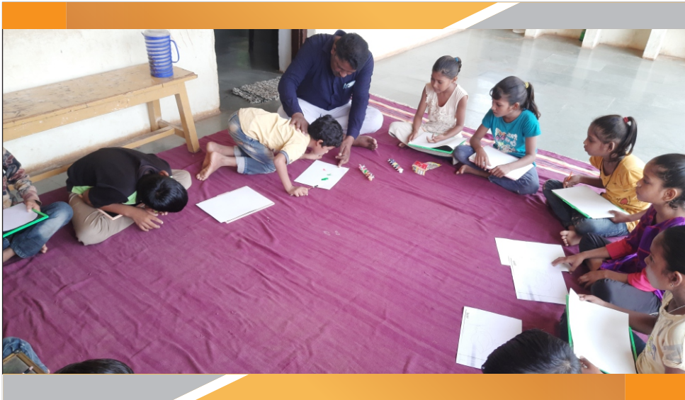
Life Skills Development programme conducted in Ashram Shala