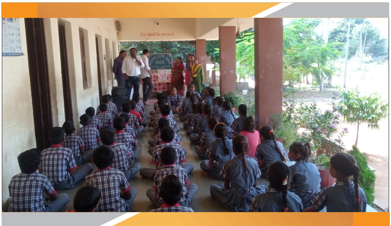
COMMEMORATION OF MAHATMA GANDHI JAYANTI With CLEANLINESS DRIVE in Public Places