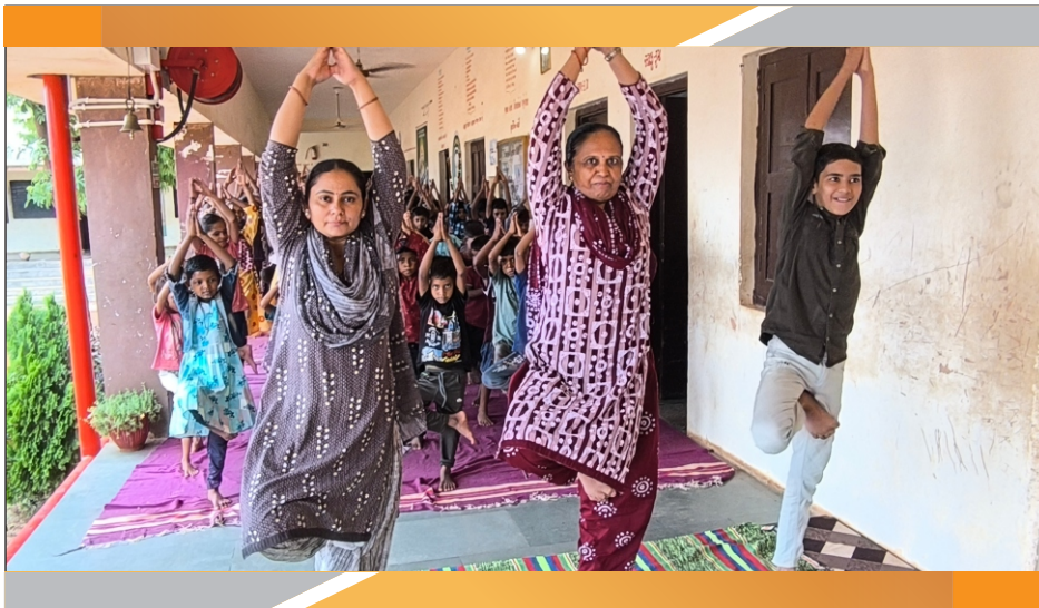
Yoga Events organised at Premises