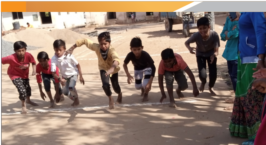
Sports Events organised at Premises