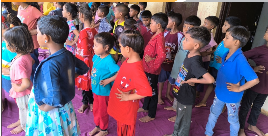
Yoga Events organised at Premises