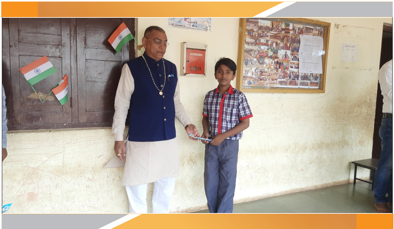
Celebration National Day event 15th August in Ashram Shala Premises