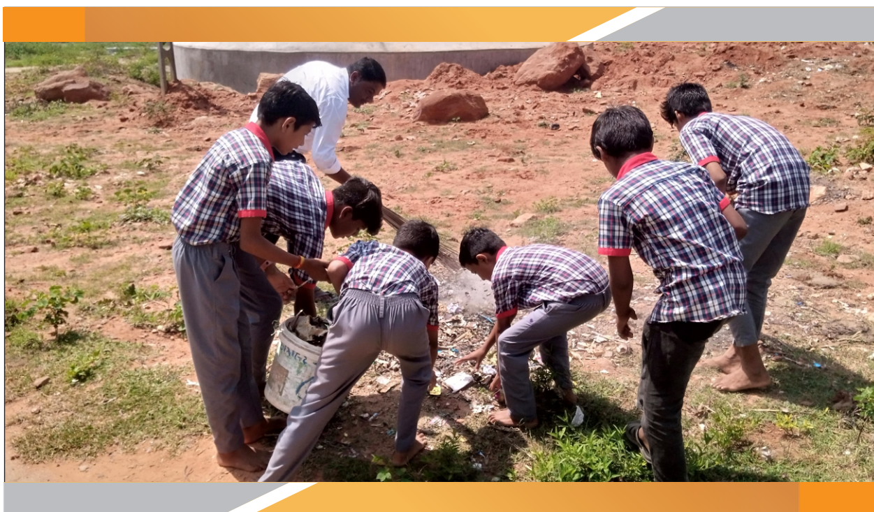
COMMEMORATION OF MAHATMA GANDHI JAYANTI With CLEANLINESS DRIVE in Public Places