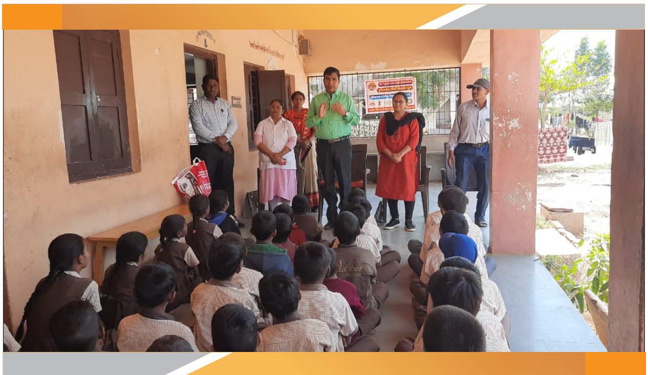
Health Check-up Camp