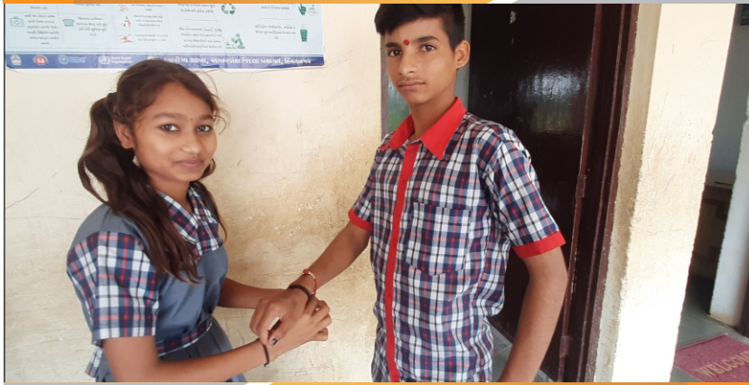
Celebration of RAKSHA BANDHAN in Ashram Shala Premises