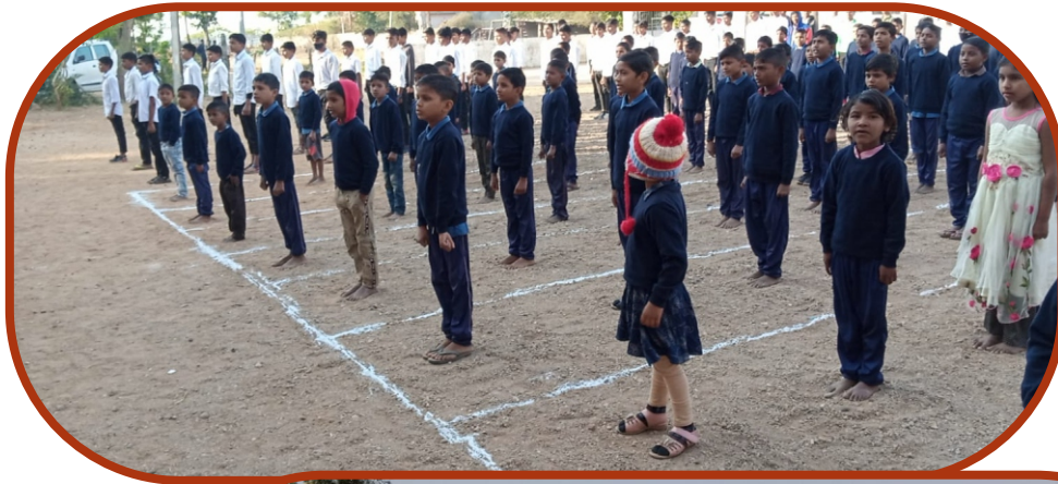
Organise Sports competition in premises of Ashram Shala & Boy's Hostel