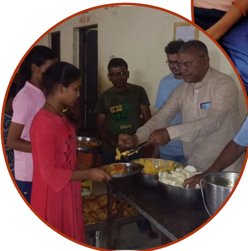
Celebration of Baba Saheb Ambedkar Janma Jayanti