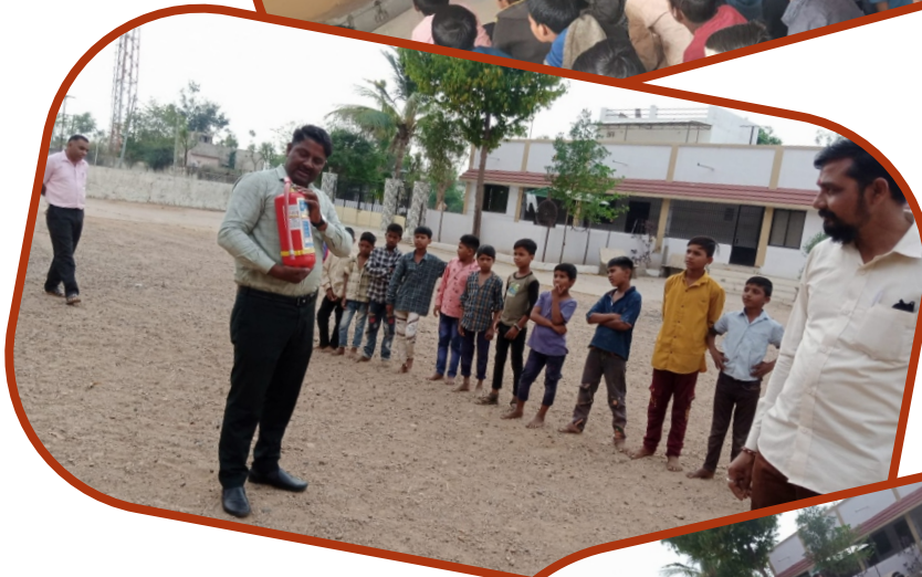
Awareness generation regarding Fire Safety & Precaution