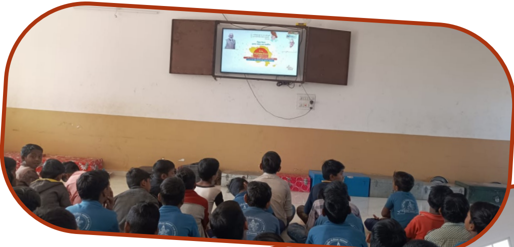
T. V. Programme (Educational Exposer)