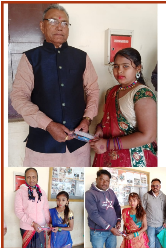
Various programmes organise on celebration of Republic Day of INDIA.