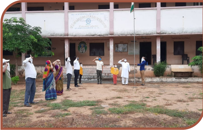
Celebration of Independence Day of India