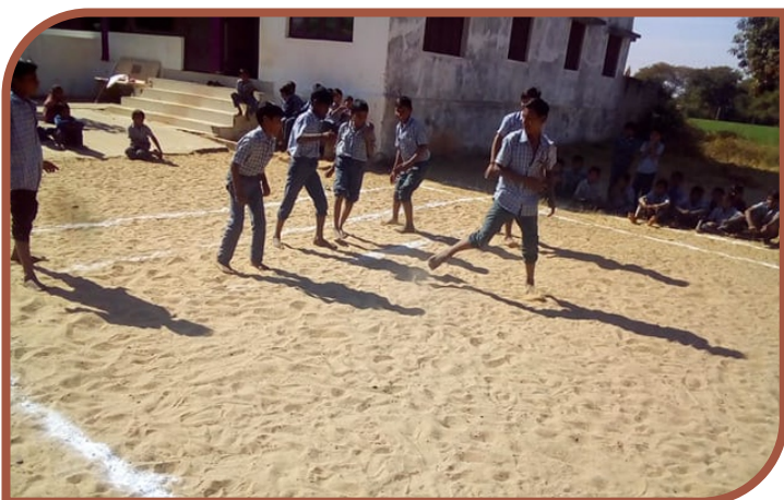
Sports competition organized at school level