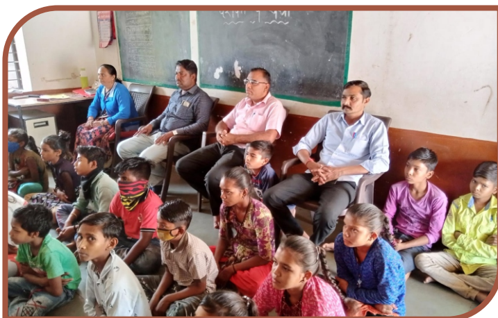
Students and teachers during discussion on examination