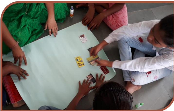
Students enjoying school activities