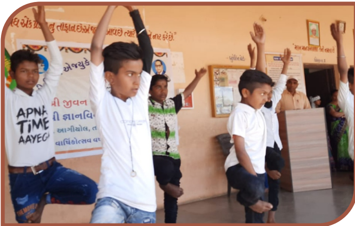
Celebration of Annual Day