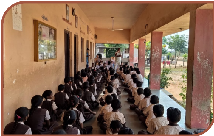
Commemoration of Baba Saheb Ambedkar Jayanti