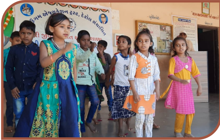
Celebration of Annual Day