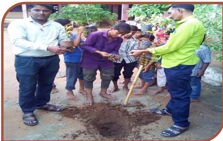
Tree Plantation drive at school level