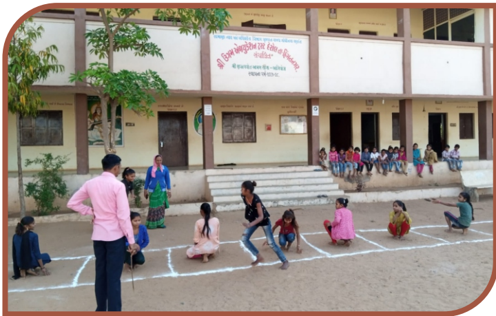
Various sports competition organized at School Premises