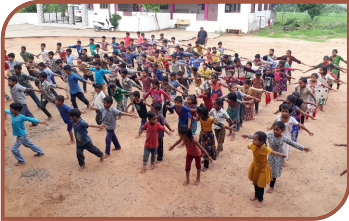
Yoga session and warming up in morning