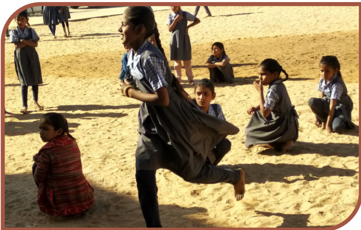
Sports competition organized at school level