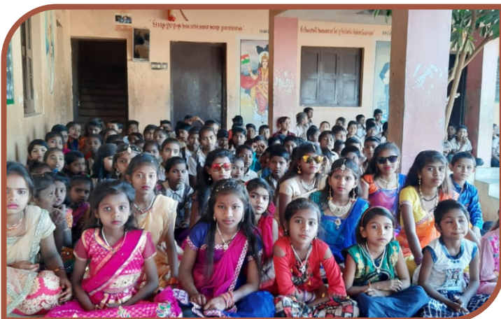
Celebration of Annual Day