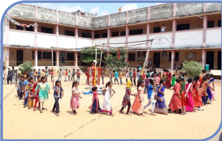
Organised Garba Activity in Ashram Shala Complex for the students