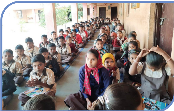
Morning prayer & warm up activities