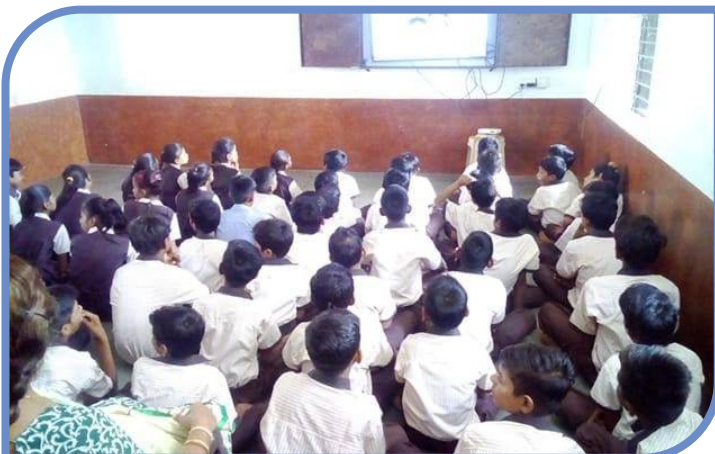
TV Show and digital media presentation for additional knowledge building