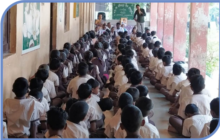
Celebration of Baba Saheb Ambedkar Jayanti