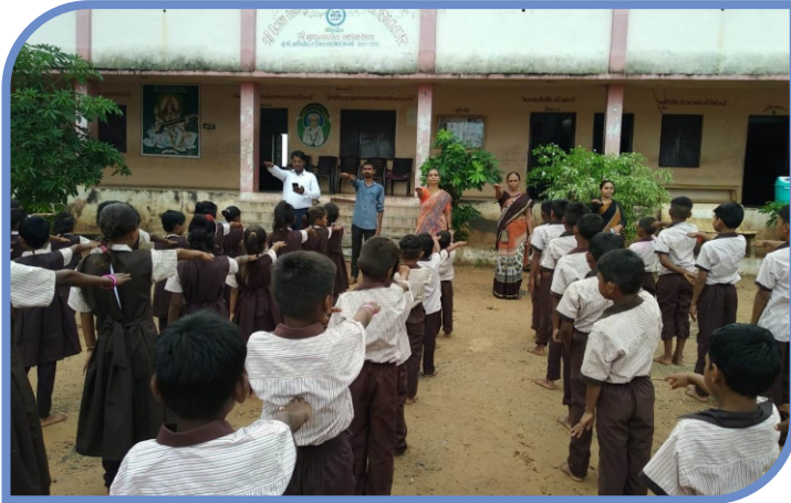
Morning prayer & warm up activities