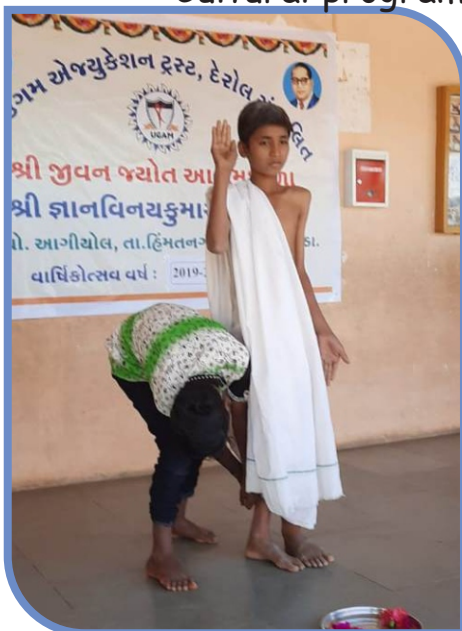
Cultural program presented by the students