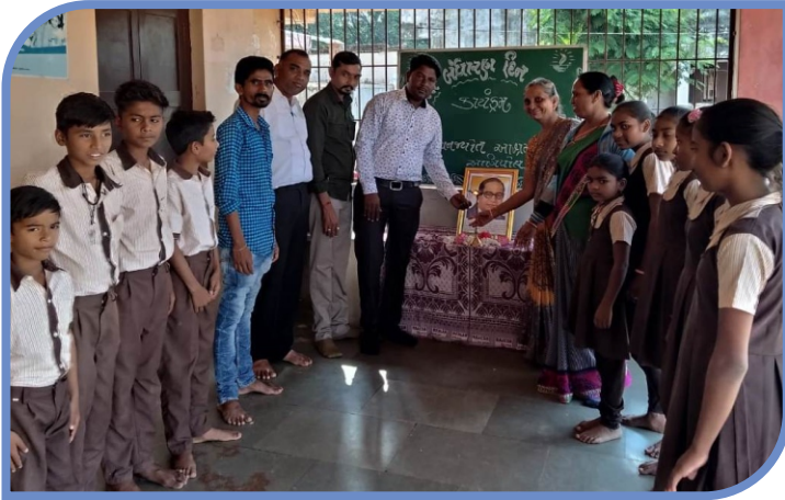
Celebration of Baba Saheb Ambedkar Jayanti