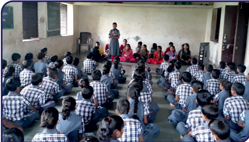
Celebration of Teachers' Day on 5th September