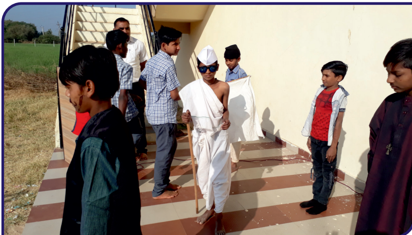
Celebration of National Day 26th January Republic Day of INDIA