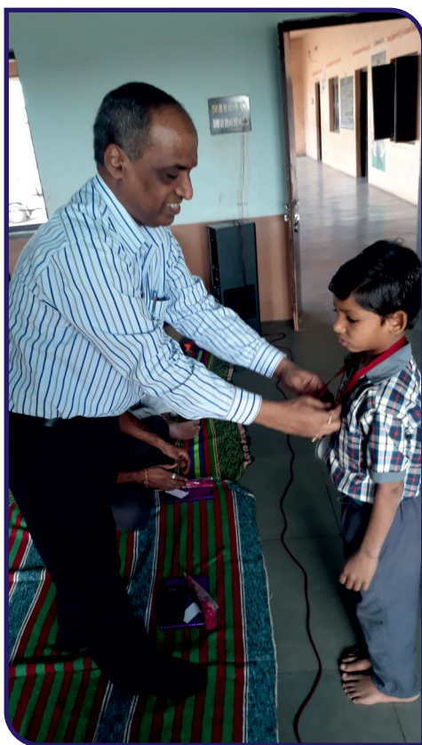
Organised Gunotsav Activity