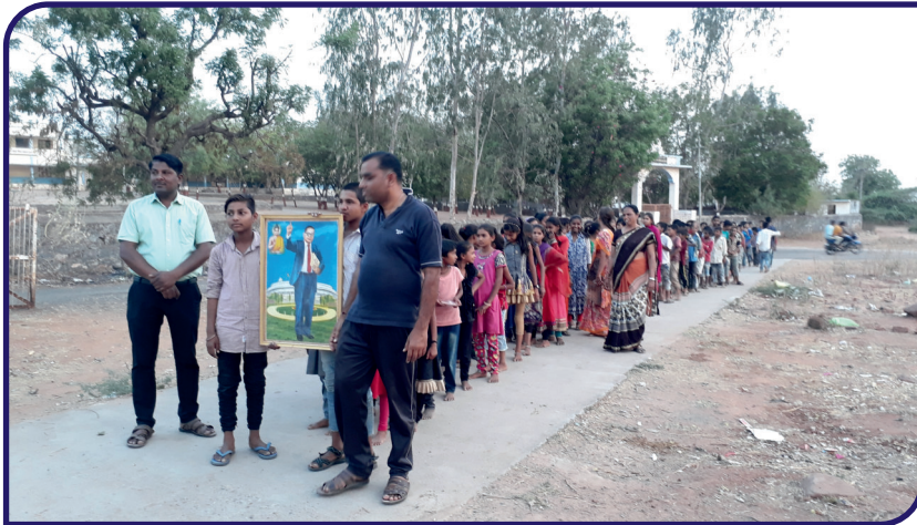
Celebration of Shri Baba Saheb Ambedkar Jayanti