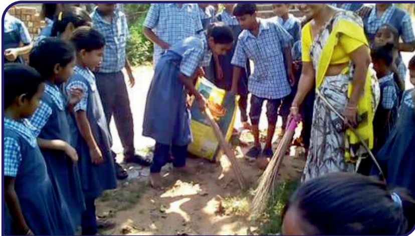
Celebration of Mahatma Gandhi Jayanti Organise Cleanliness Drive & Yoga