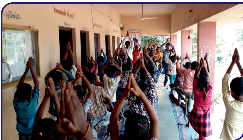
Celebration of International Yoga Day