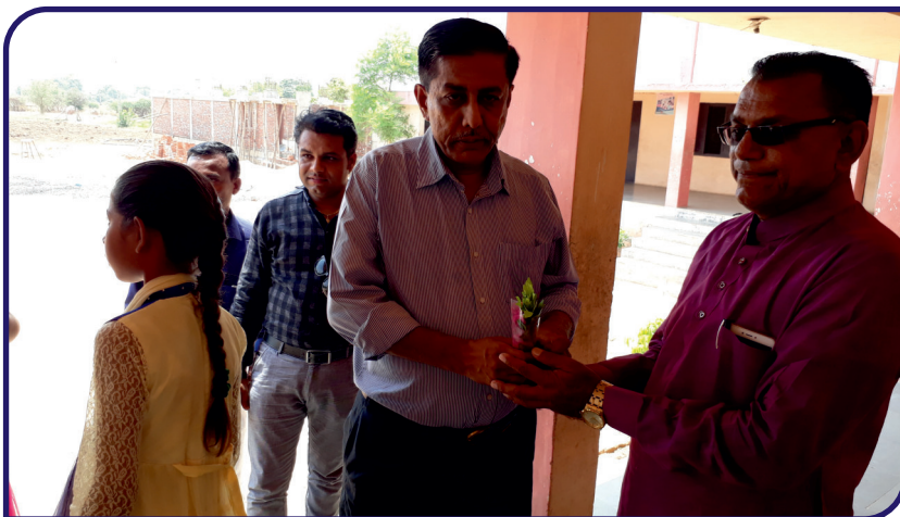
Celebration of Shala Pravetsosav