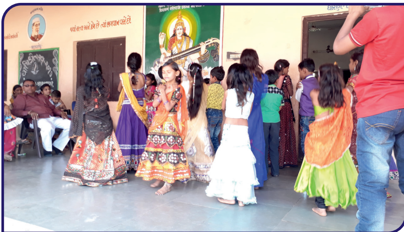
Celebration of National Day 15th August Independence Day of INDIA