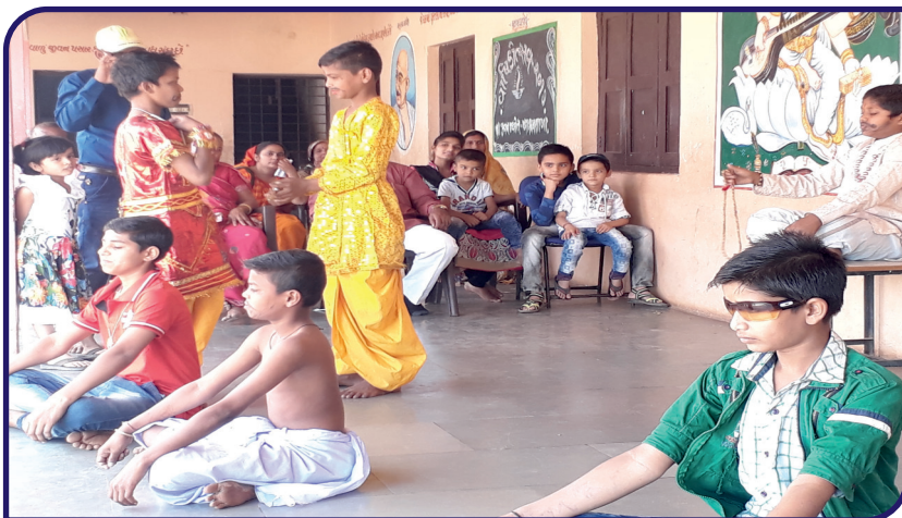
Organised Annual Day at Ashram Shala