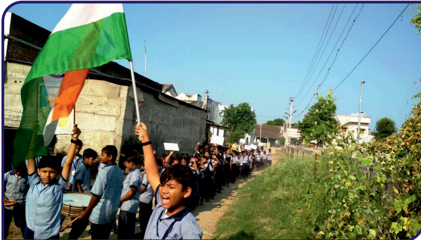
Celebration of Mahatma Gandhi Jayanti