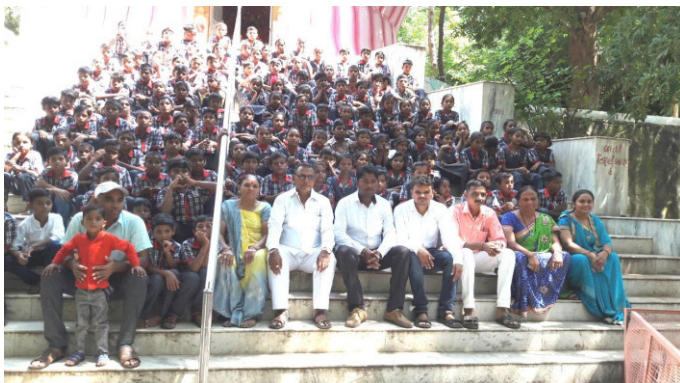
Van Bhojan Programme