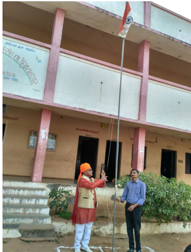
Celebration of 15th August