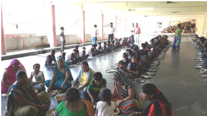
Van Bhojan Programme