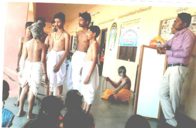
Cultural Program during 26th January