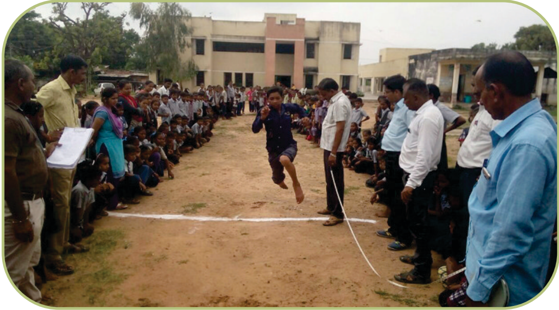
Sports Activities Competition organised at School Level