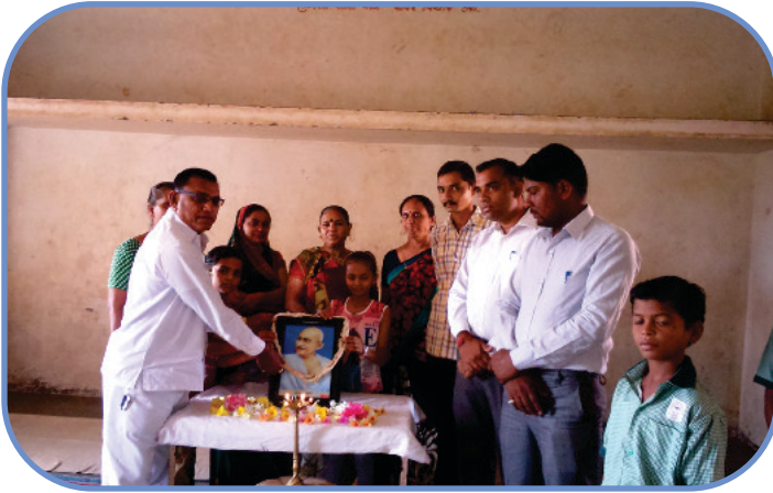
Celebration of Gandhi Jayanti