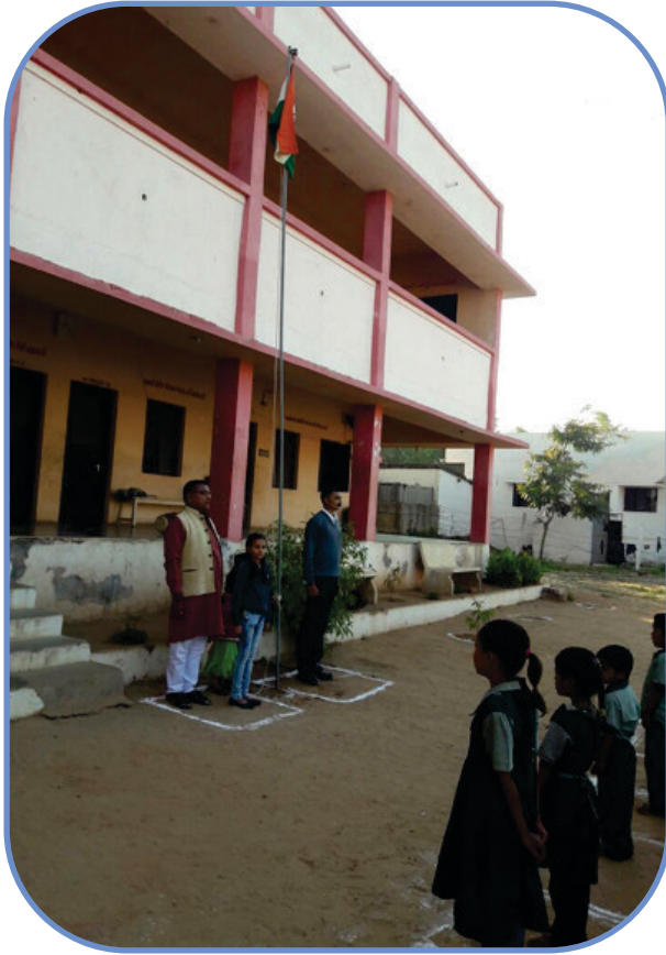
Celebration of 15th August and Elocution competition